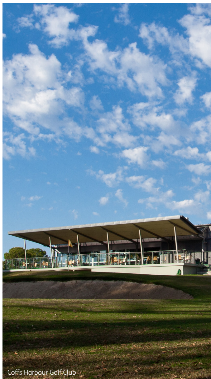
Coffs Harbour Golf Club

The total fees for music on hold, TV screen, music in the background, for functions and live performances is $1,518.39 per year.